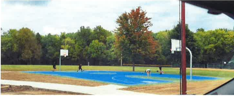
Figure 2 - New Basketball Court at Heritage Park